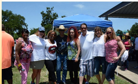
Below STAR Graduates and Staff at the Drug Court

Center. Despite the blazing heat, the picnic was attended by a collection of new and old clients, hosted by the STAR Alumni. It exemplified a collective effort of each client to